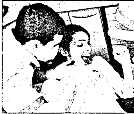
SILENT TREATMENT: Studies have shown that for many people it is the sound of the drill that causes the most anxiety about visiting the dentist

Containing a microphone and a chip that analyses soundwaves, it plugs into the MP3 or mobile ahead of the headphones, and uses adaptive filtering to mask only the disturbing sound of the medical equipment, such as the drill and suction pipes, the Daily Tele-